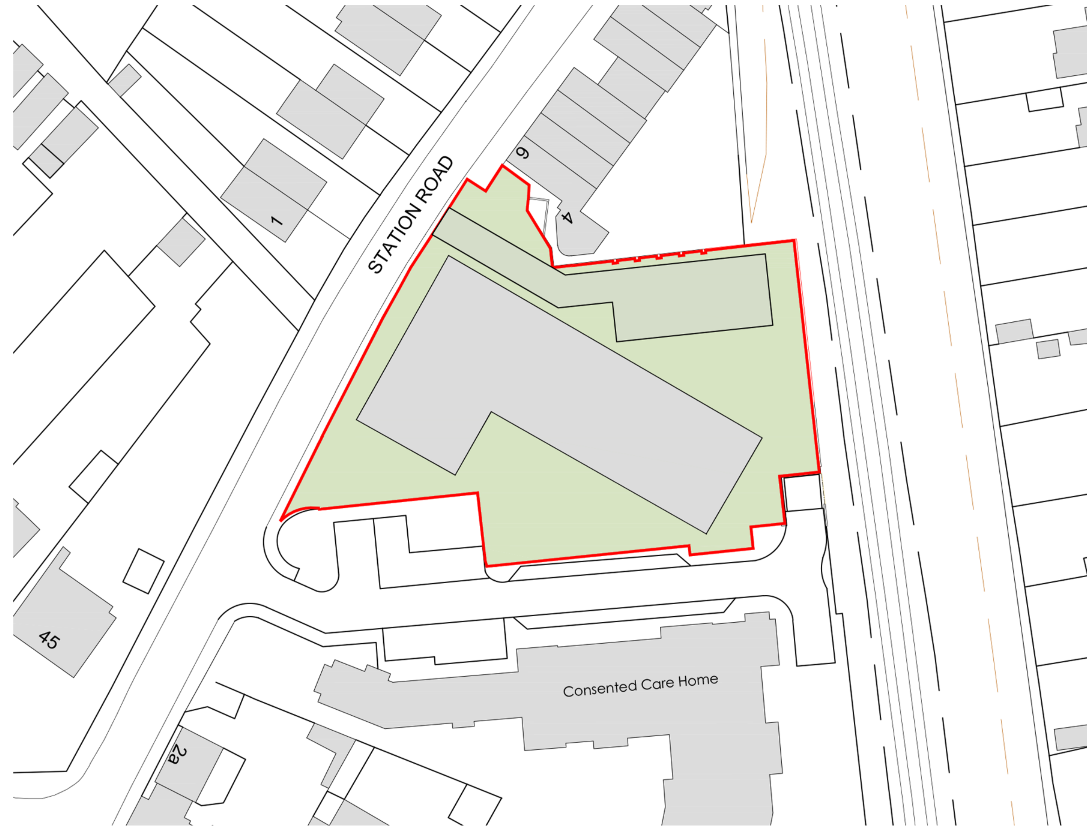
1. 'L' Shaped footprint fronting Station Road