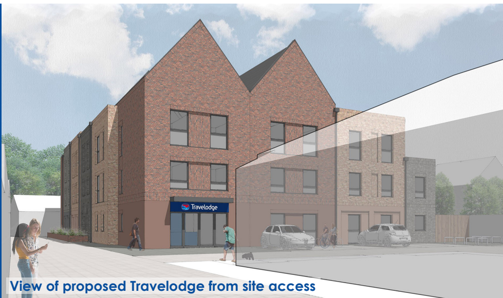
View of proposed Travelodge from site access