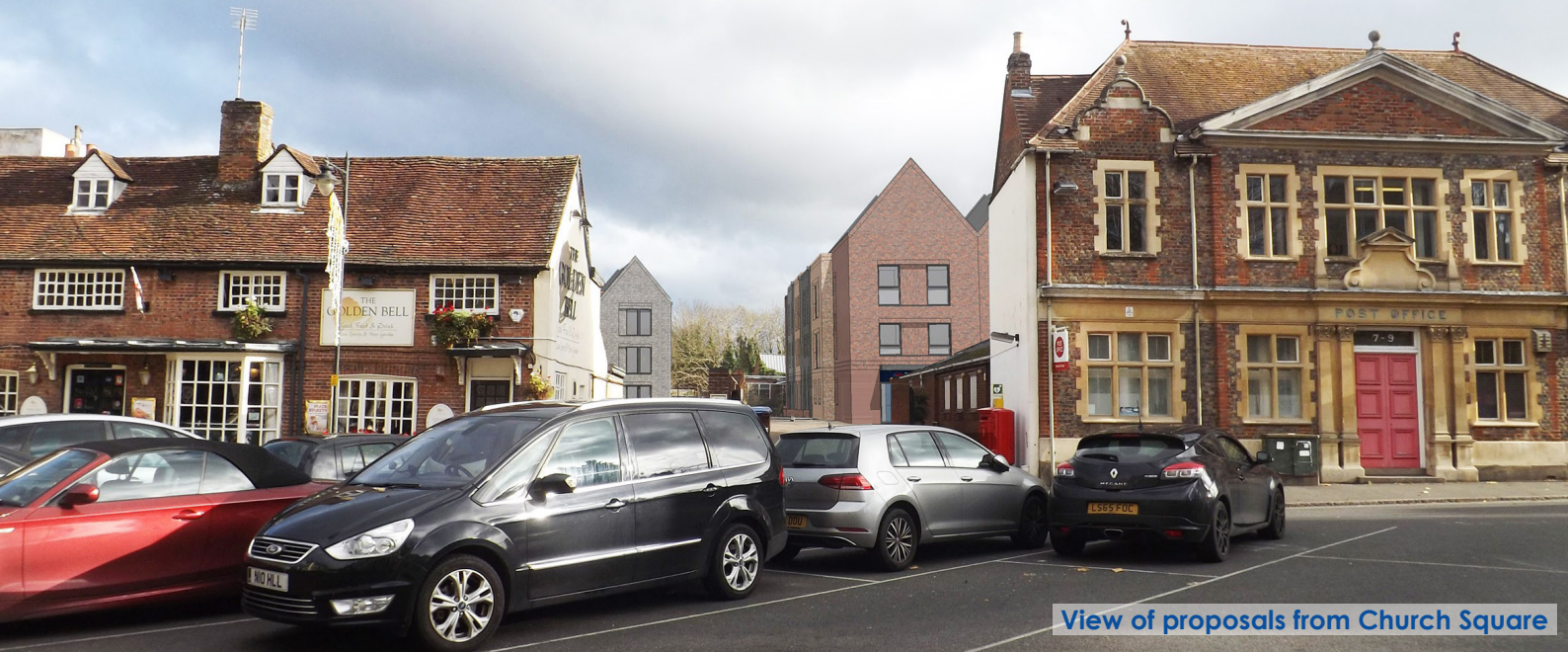
View of proposals from Church Square

Mayfair 500 is working in partnership with Travelodge, one of the UK's most prominent value hotel operators, to bring forward plans for a new 58-room Travelodge hotel and flexible commercial space on the former sorting office site in Leighton Buzzard town centre at 7 - 9 Church Square.