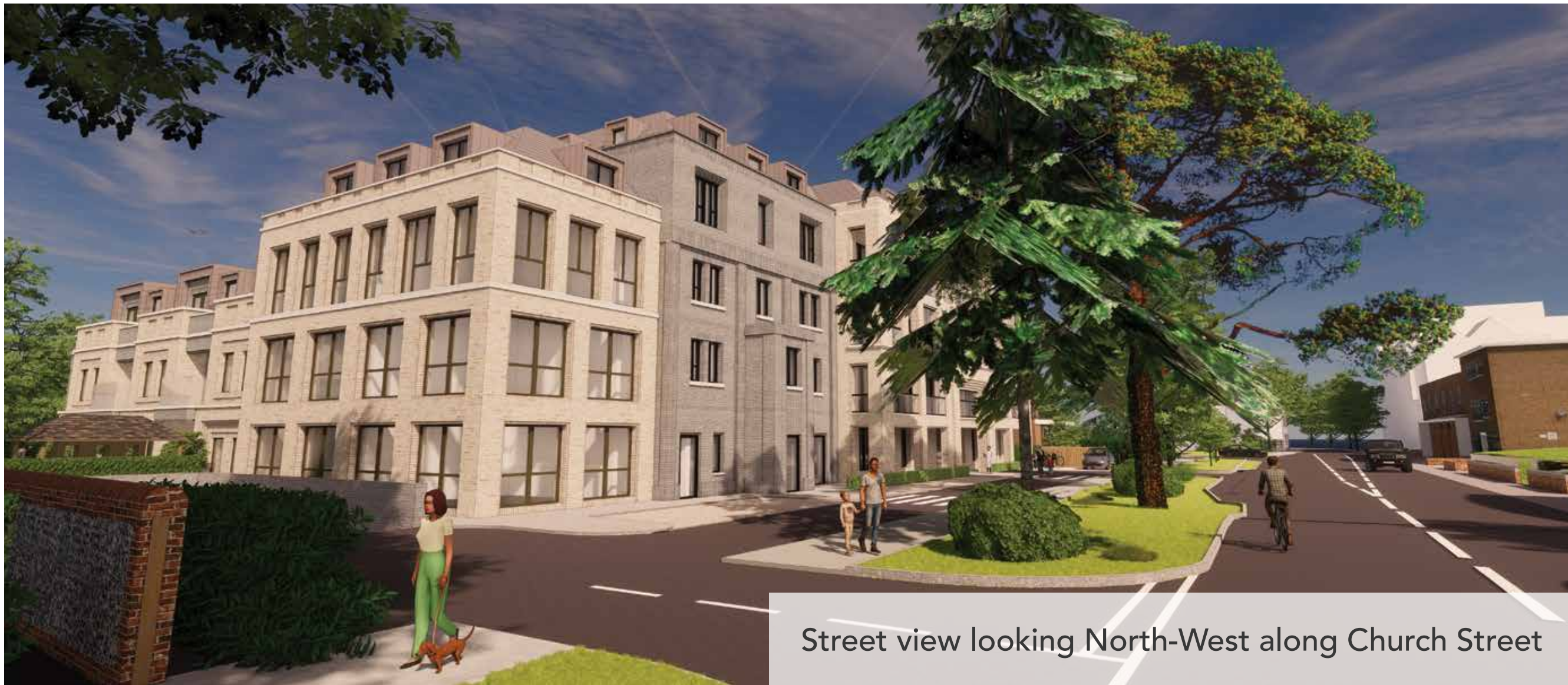
Street view looking North-West along Church Street