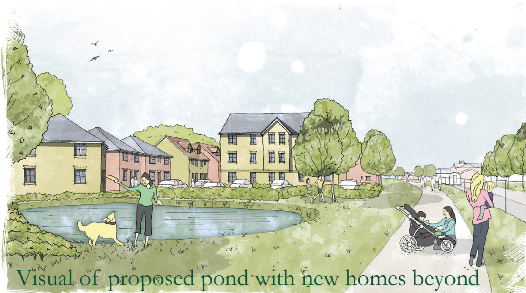
Visual of proposed pond with new homes beyond

Street trees are also proposed along the access road to create a pleasant street scene.