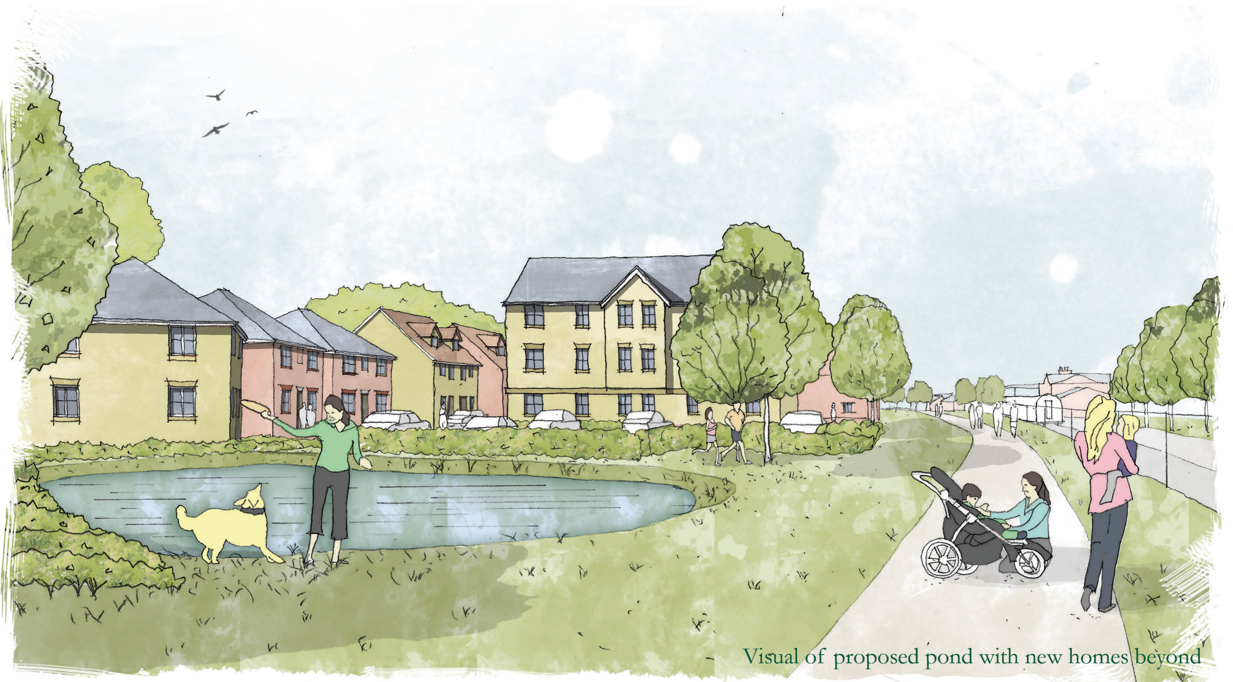
Visual of proposed pond with new homes beyond