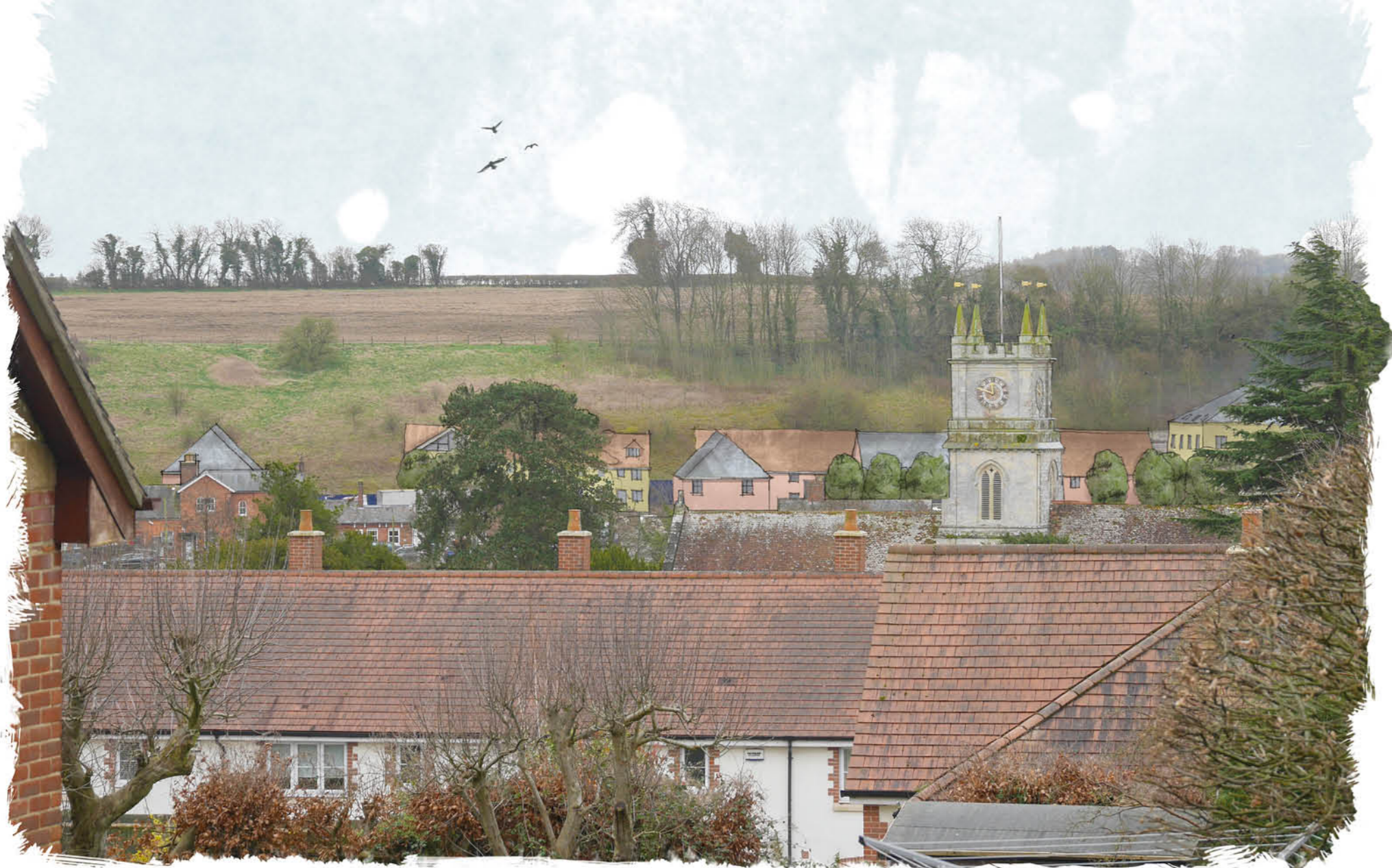
Long distance view of the proposals

In keeping with the mix of materials found in the village, building materials are proposed as a combination of red brick, pale-coloured render, with the occasional use of natural stone on feature walls. Roofs will be covered either in gray slates or redbrown clay tiles.