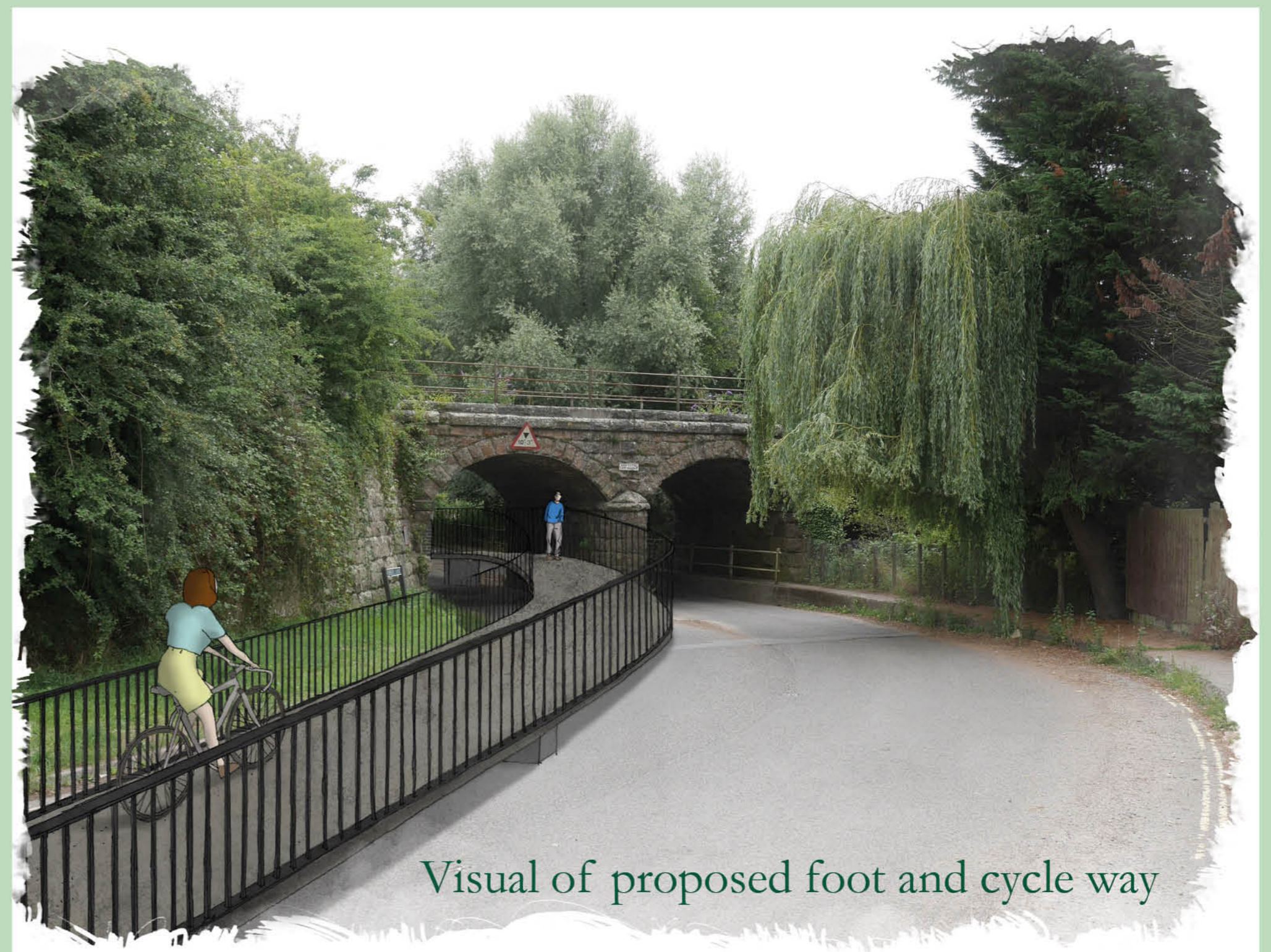
Visual of proposed foot and cycle way